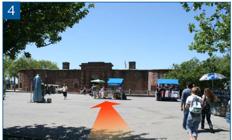
Ahead is Castle Clinton. To purchase tickets, walk through to the middle of the building. If you already have a “Reserve Ticket” you may go straight to the security screening tent located behind Castle Clinton, along the seawall. If you have a “Flex Ticket”, ask a uniformed crew member for the end of the flex line.