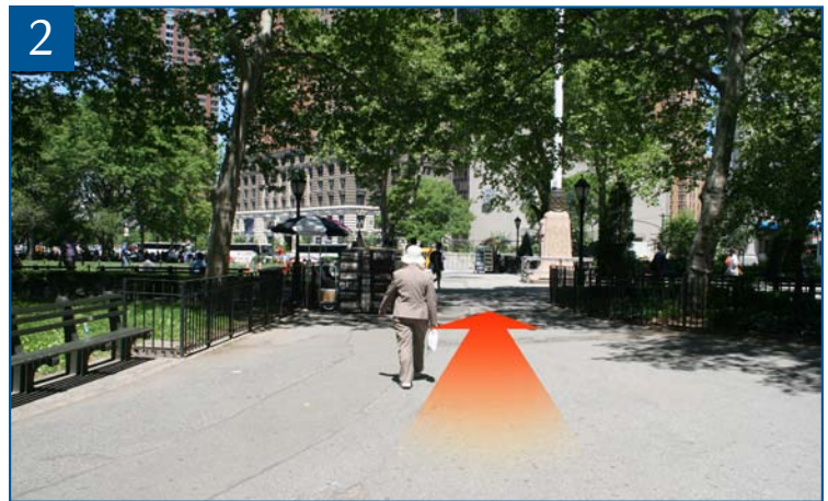
Walk towards the flag pole, then turn left.