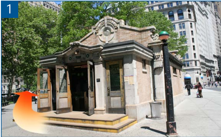
Starting at the Bowling Green Subway stop, walk out of the building and turn right heading into Battery Park.

For further questions, please call 877.523.9849