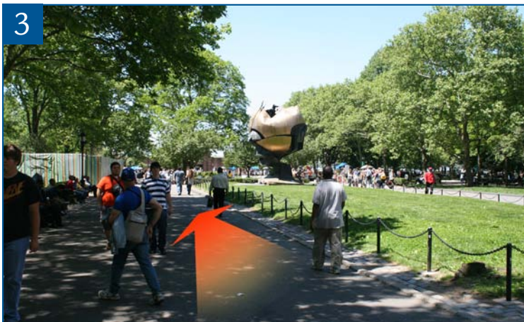
Walk past the World Trade Center Memorial sculpture.